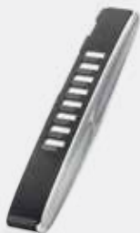
8-line Key Module