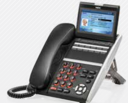
DT830CG Color Display