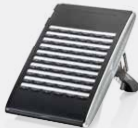
60-line DSS Console