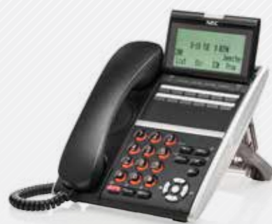
DT430 & DT830