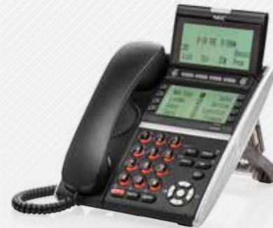
DT430 & DT830 Dual Display (Desi-less)